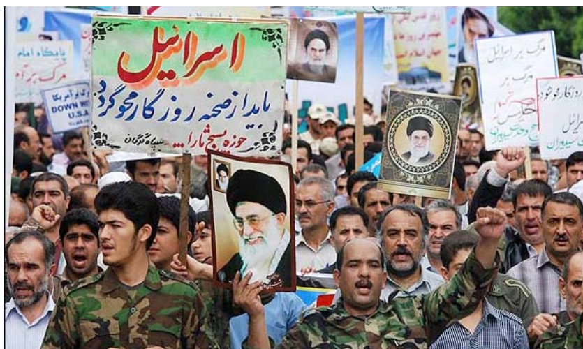
Israel should be wiped from the annals of history – Jerusalem Day, August 26, 2011

There is ample legal basis for the prosecution of Ahmadinejad and other Iranian leaders in the International Court of Justice and the International Criminal Court for direct and public incitement to commit genocide and crimes against humanity. 52