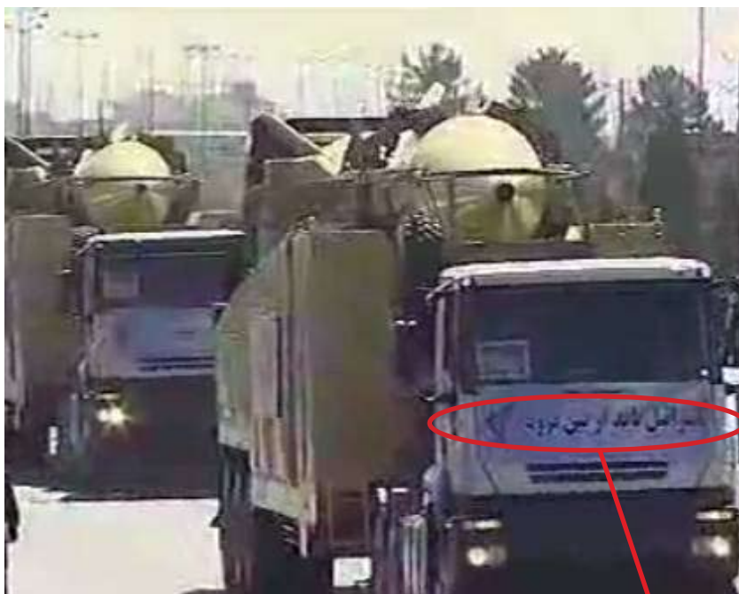
Footage of Shahab-3 missile transport vehicles on parade. Visible on the front is a draped slogan stating “Israel Must Be Destroyed.” Iranian Revolutionary Guard in Tehran, Islamic year 1389 (March 2010-March 2011) http://www.youtube.com/watch?v=UZpLFvcJaIM

Another variation of this theme was evident in last year’s military parade: